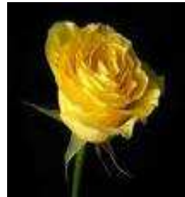
The Yellow rose the Zonta symbol

Entry fee $5.00. Purchases need to be paid for with cash or cheque ONLY as no credit facilities will be available.