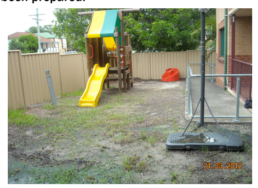
This is how the playground used to look ... Revised images to come

Sandgate Club will also attend and a plaque acknowledging our donation to this project has been prepared.