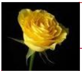
The yellow rose, Zonta's symbol