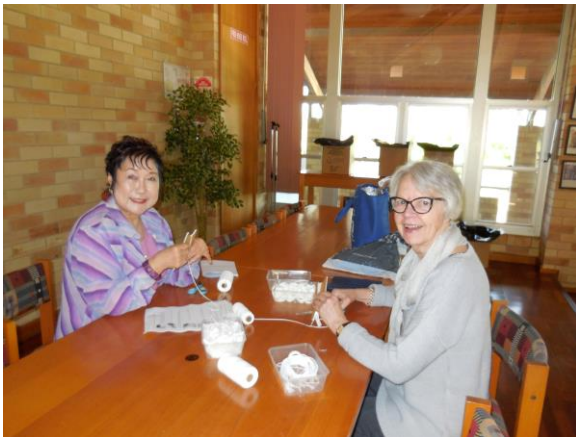
Birthing Kit Assembly day at Duchesne College –