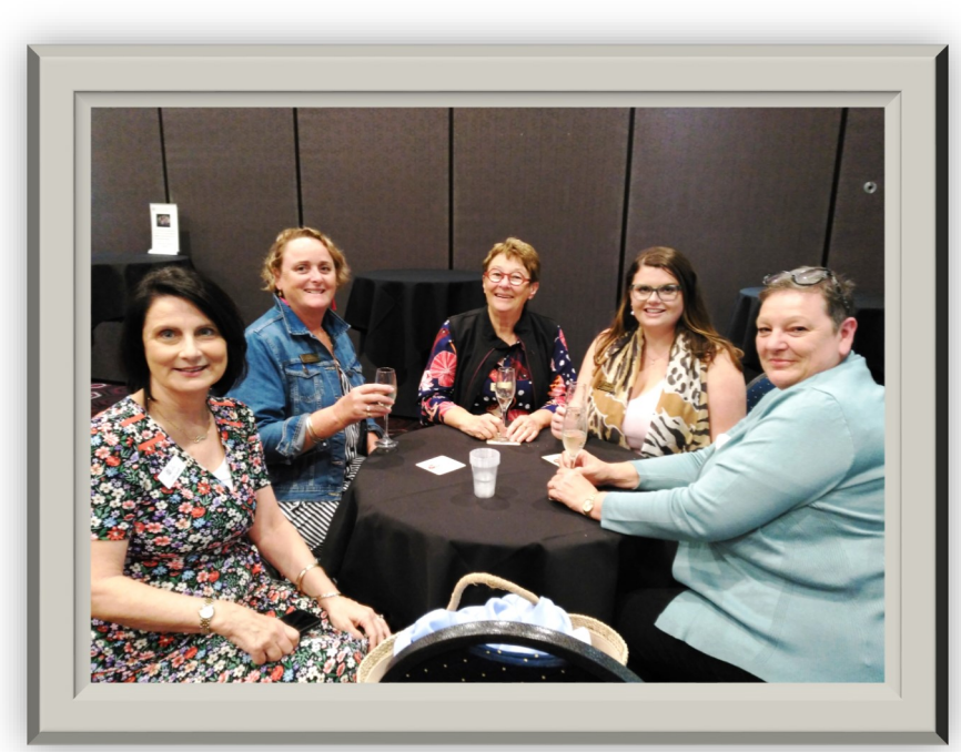
The Beaudesert crew lunching with a couple of Wynnum Redlands ladies.

As I write we are about to move to our new home at Gleneagle...perhaps a Zonta morning tea one day??