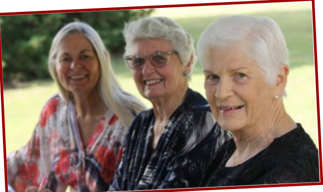
Guests, workers, models and hosts.