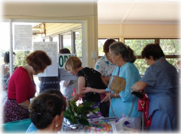
Buying raffle tickets.