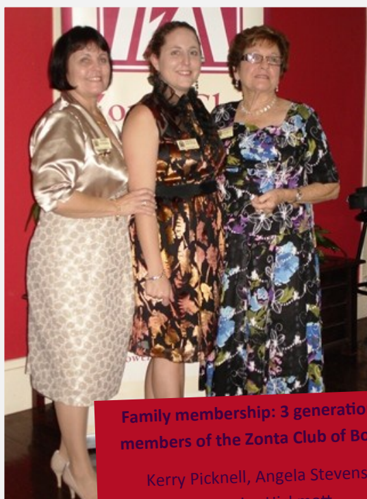
Family membership: 3 generations all members of the Zonta Club of Bowen.