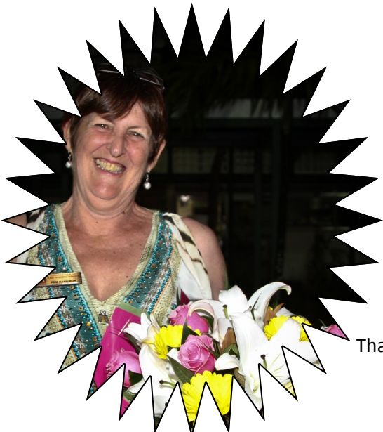
Thanks to Pammie for making it all possible