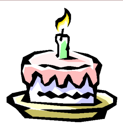
Who's 21 Again?