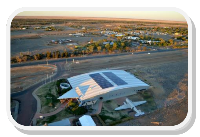
Aerial view of the Qantas Founders Museum.

Area meetings are hosted by a club in the area and can be one or two day events. The area director is responsible for planning the meeting with the assistance of other members of the district board and of the host club. The governor may direct that all area meetings cover the same subjects. The format may vary from area to area. The presiding area director reports to the district board following the area meeting. The District Governor attends the meeting.