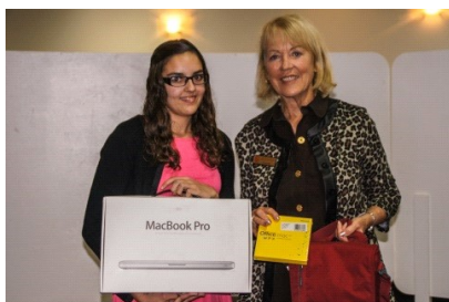
Helping local girls with their education