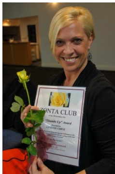
Thumbs Up Award for Members of the community