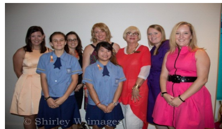
International Women's Day 2014