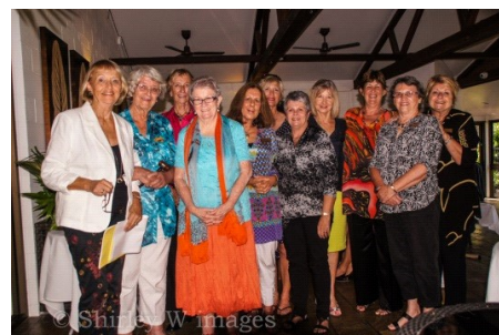
Board members for 2012~2014