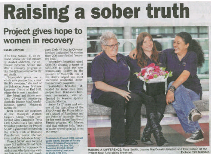
The Project NOW breakfast made the news.