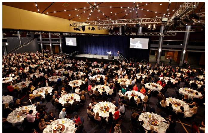
↓ An incredible turn out for Project NOW

To all Zontians who supported this event, thank you. The effort continues with $150,000 still needed to meet the target of $750,000.