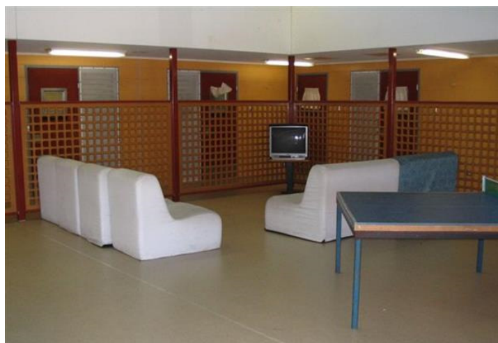
Inside the BYDC