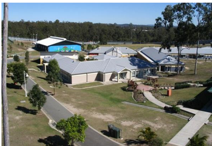
The grounds of the BYDC