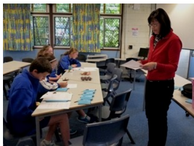
Above: Students learning about meeting procedure and committee roles

Both groups were very appreciative of the 'personal hygiene packs' the Z Club had donated.