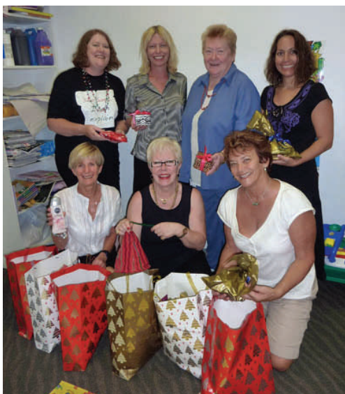
Committee & WC&CS staff with pamper packs