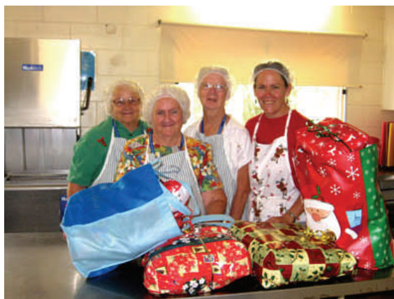
Staff at Meals on Wheels accepting the hampers