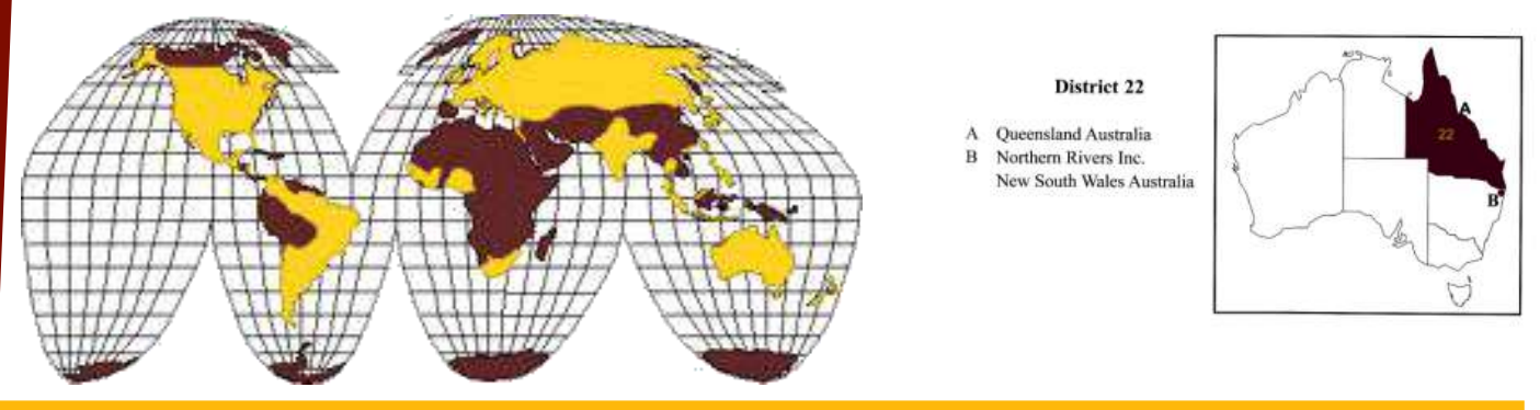
'advancing the status of women worldwide through service and advocacy'

Zonta maintains a presence in countries marked in Gold.