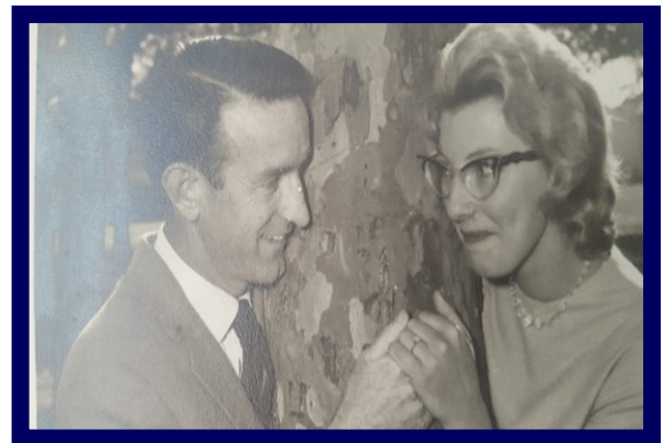
This is dad with his sister and one pic of the family.